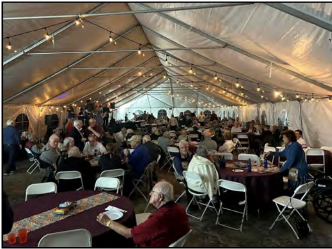
Celebrating the first event of the 2023 AACAA Winter Nationals with a Caribbean night at the Gold Coast Railroad Museum.