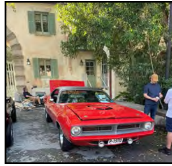
1970 Plymouth Barracuda