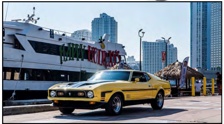
Seen beside a tour boat at the docks of Miami

If you asked me in first grade when I attended public school in Dade County that I would be back almost six decades later and living maybe ten miles from Hialeah Hospital where I was born I would have never believed it. But, having also lived in Nassau and Saudi Arabia in the 1960's I guess I was destined to come back to the mostly year round sunshine and my family is enjoying the car scene here very much and am looking forward to making a whole new group of car enthusiast friends. I had not participated in many shows the last five or so years in Virginia but I did always enjoy the All Ford shows in Carlisle, PA and of course the Hershey fall swap meets. I know I've rambled on far too long but there are just so many stories and memories that it's hard to fit them all in into a few pages. Next time you see me ask me about the time in 1997 when two US Presidents were in the same hotel ballroom with executives from Fortune 500 companies with - you guessed it - a certain 1972 yellow Mustang Mach1 on display with a 1972 Corvette and a 1972 Duster.