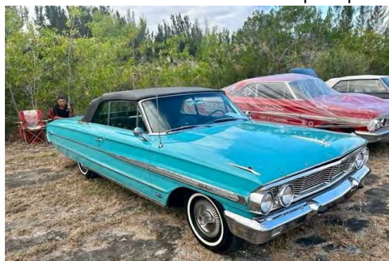
1964 Ford Galaxy