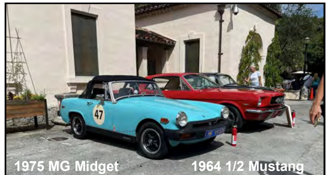
1975 MG Midget