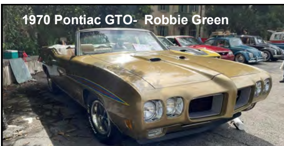
1970 Pontiac GTO- Robbie Green