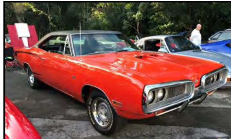
1970 Dodge Coronet Super Bee Mohammed Shanti