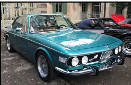
1973 BMW 3.0CS- Drew Gregg