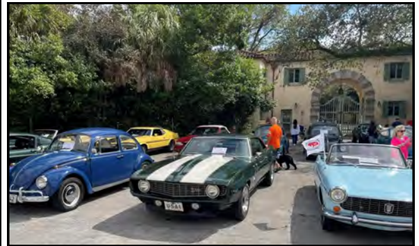
1969 Chevrolet Camaro Z28