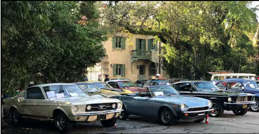
1967 Ford Mustang GT Fastback 1985 Fiat Pinarina