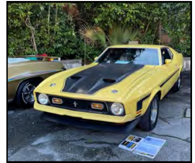
1972 Ford Mustang Mach 1