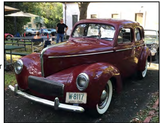
1938 Willys Clipper