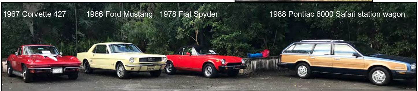
1988 Pontiac 6000 Safari station wagon