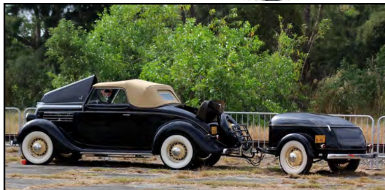
Gerald Houck's 1935 Ford 48-760 with Mullins "Red Cap" trailer