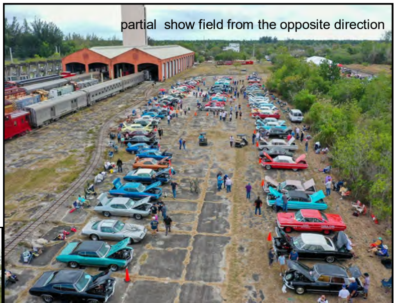
partial show field from the opposite direction