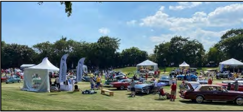
A portion of the show field