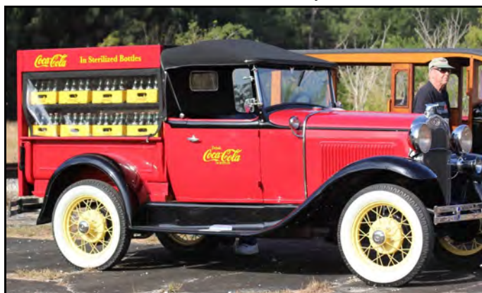
Edward Dauer's 1930 Ford pickup