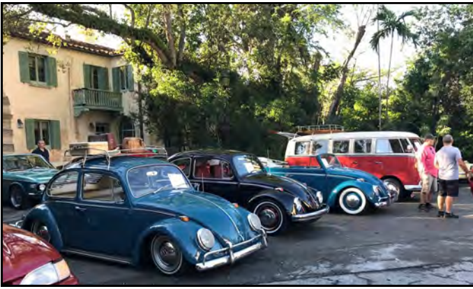
Volkswagen Beetles: 1965 1969 1964 1964