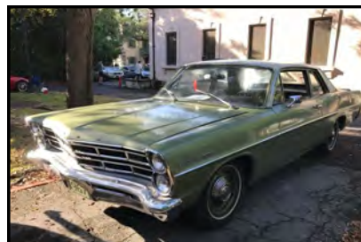
1967 Ford Custom