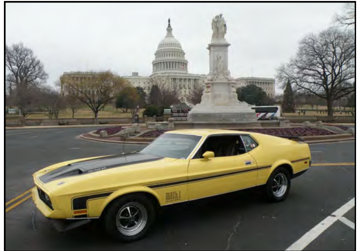
Seen in a traffic circle with the US Capitol building in the background. The statute is the Peace Monument. https://en.wikipedia.org/wiki/Peace_Monument