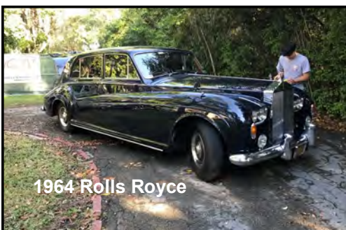
1964 Rolls Royce