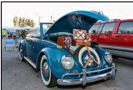
L: Hector China's 1964 Volkswagen convertible