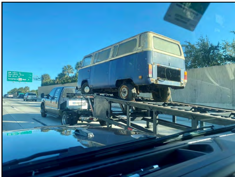
Someone's future restoration being towed on the 826 in Miami.