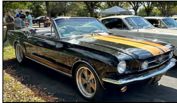
Ed Medina's 1965 Ford Mustang convertible