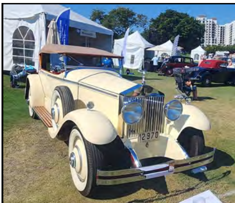
L: 1928 Rolls Royce