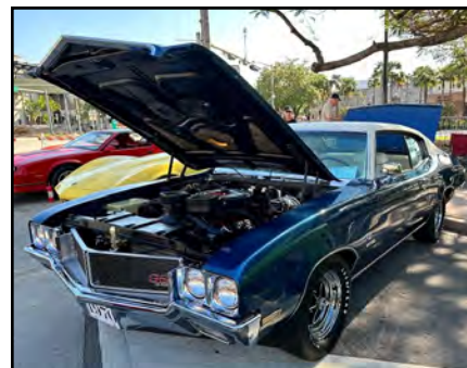
Juan Rodriguez's 1970 Buick GS Stage 1