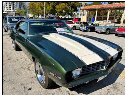
Keith Ellenburg's 1969 Chevrolet Z28 Camaro