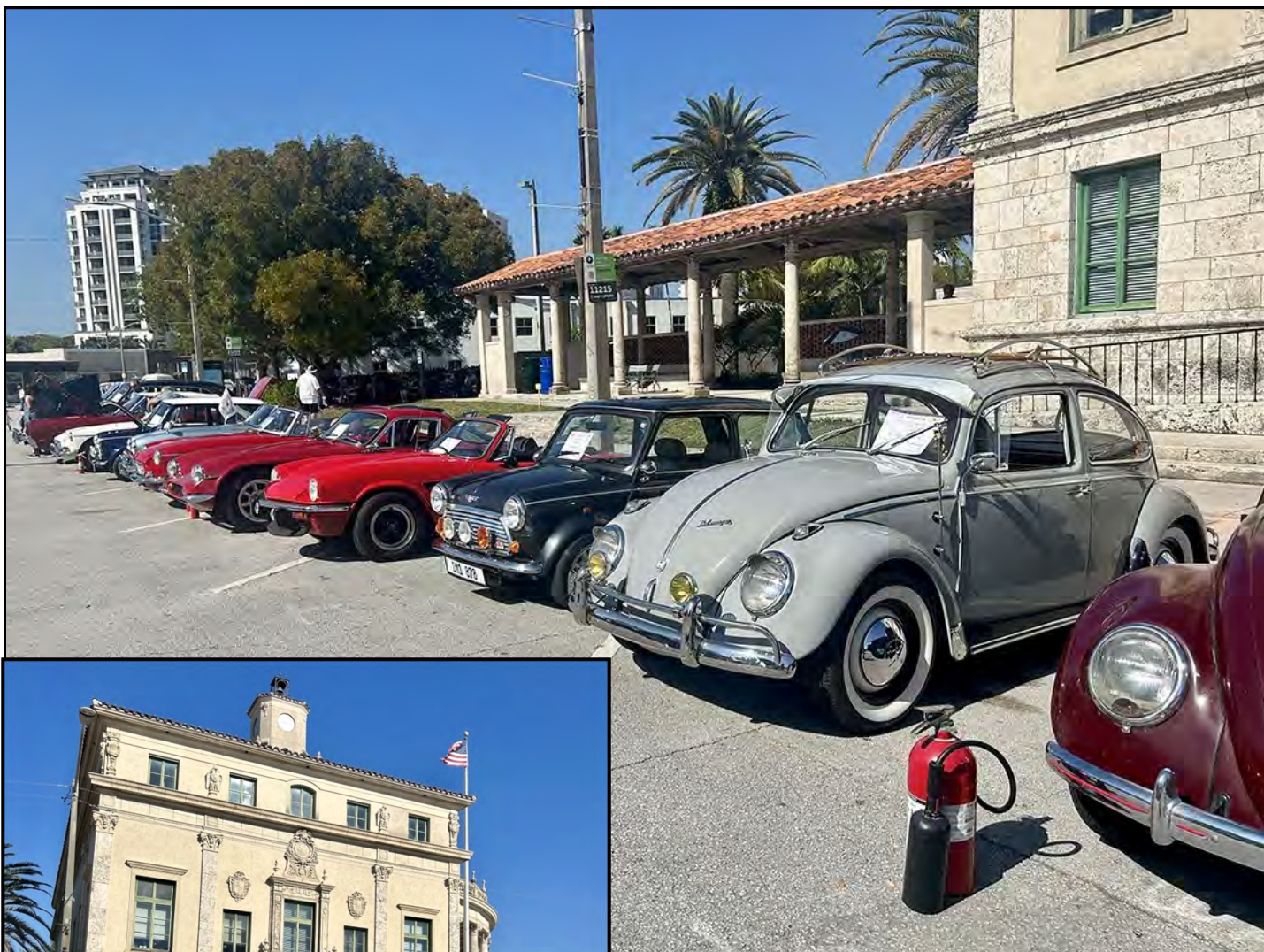
RUBENSTEIN LAW ANTIQUE CAR & MOTORCYCLE BILTMORE WAY SHOW (STORY ON PAGE 6)