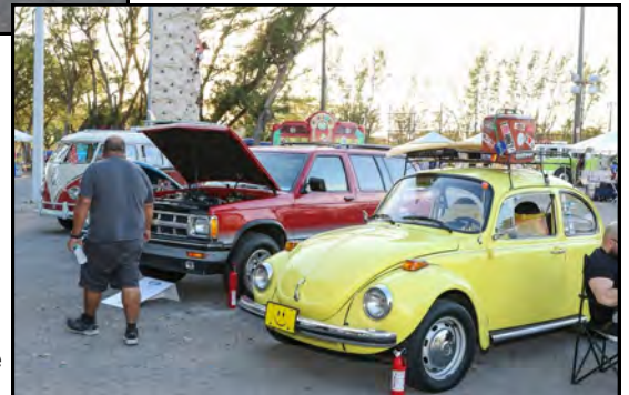
R: Fabio Nodarse's 1973 Volkswagen Super Beetle