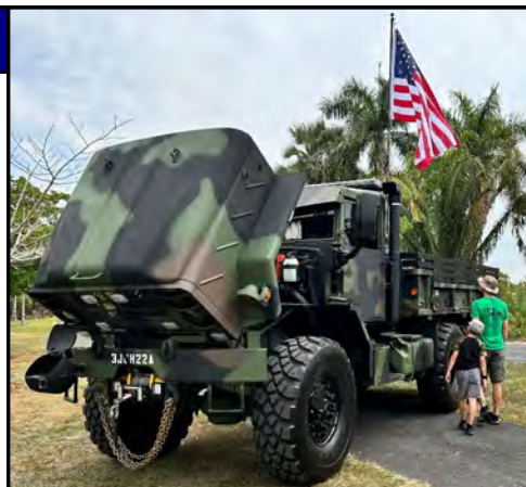
Left: This military truck was brought from the neighboring Military Museum