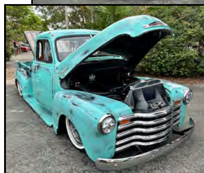
Left: 1950's Chevrolet pickup