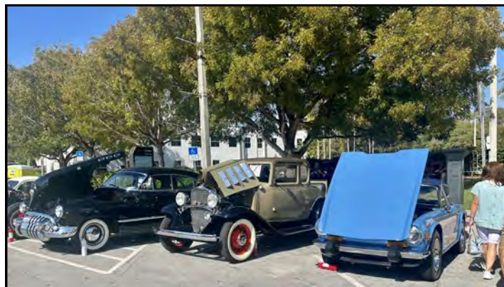
Cars waiting to be judged