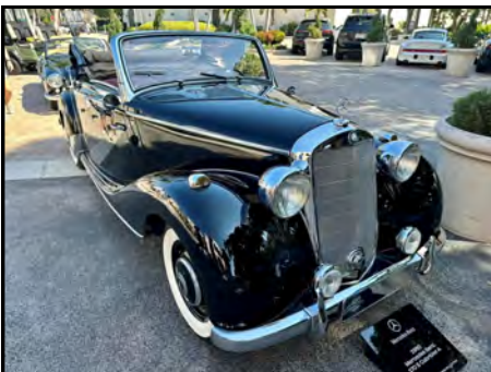
L: 1950 Mercedes-Benz 170S Cabriolet A