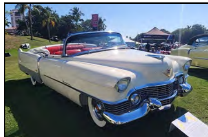
1954 Cadillac Series 62