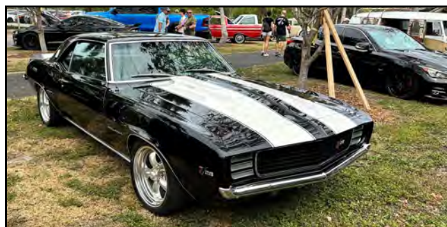
1969 Chevrolet Camaro 302 Z28