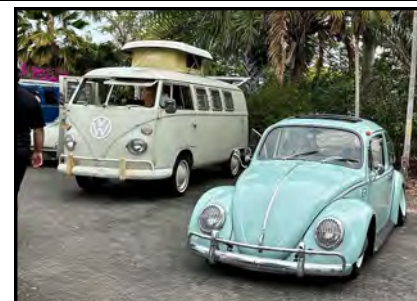
Several vintage and new Volkswagens were seen.