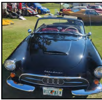
1960 Auto Union