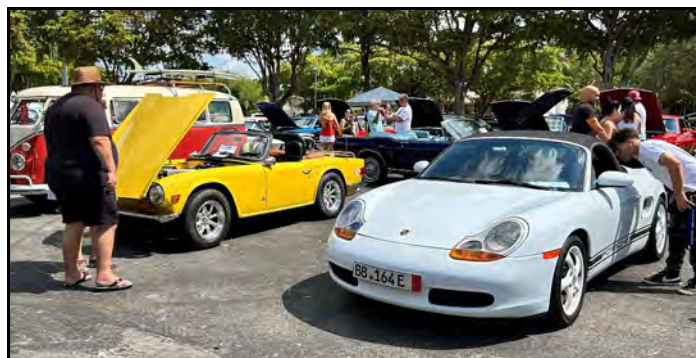
1973 Triumph, Rodolfo Campos' 1997 Porsche Boxter