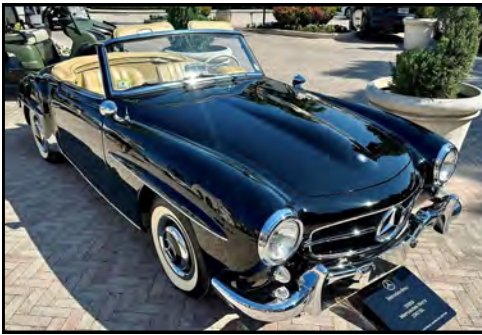
1959 Mercedes-Benz 190 SL