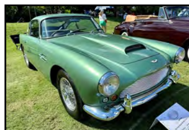
1961 Aston Martin DBA4 MKII