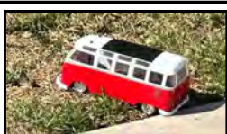
Jorge Salazar's 1964 Volkswagen Type 2 Bus and its miniature version on the left