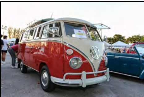
Jorge Salazar's 1964 Volkswagen Type II Deluxe