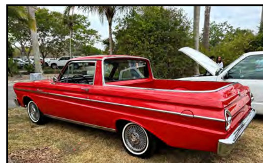
Right: 1960's Ford Ranchero