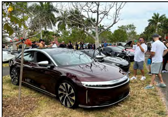
The electric 2023 Lucid drew many onlookers.