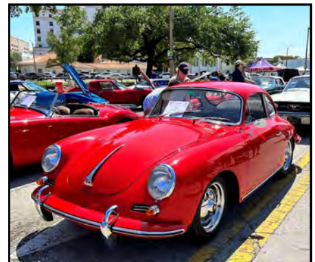
Agusto Sanchez's 1963 Porsche