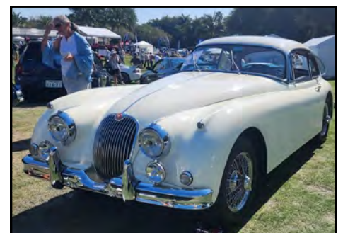
1957 Jaguar XK 150 2 door Fixed Head Coupe