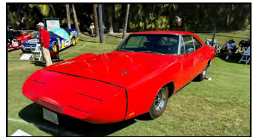
Founding Chairmen's Award: 1969 Dodge Charger Daytona SE-2 door