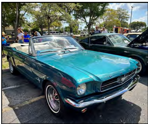
Larry Weschler's 1965 Ford Mustang