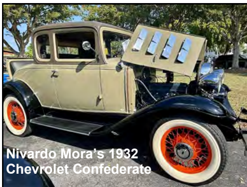
Nivardo Mora's 1932 Chevrolet Confederate