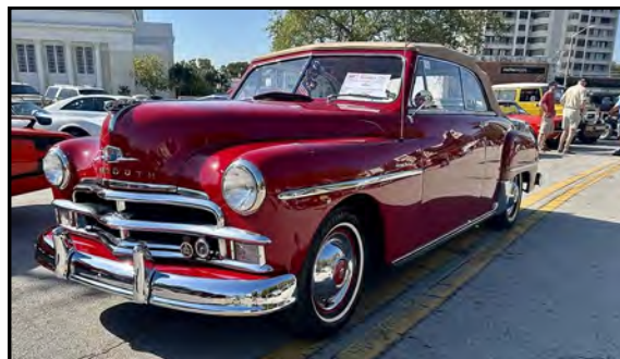
R: Paul Rufat's 1950 Plymouth Special Deluxe convertible