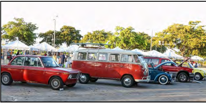
L: Our members cars