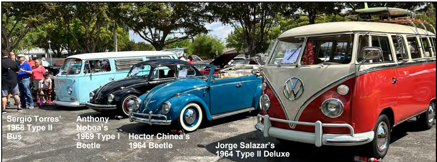
Sergio Torres' 1968 Type II Bus