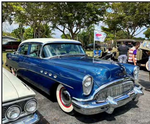
L: Al Padilla's 1954 Buick Roadmaster