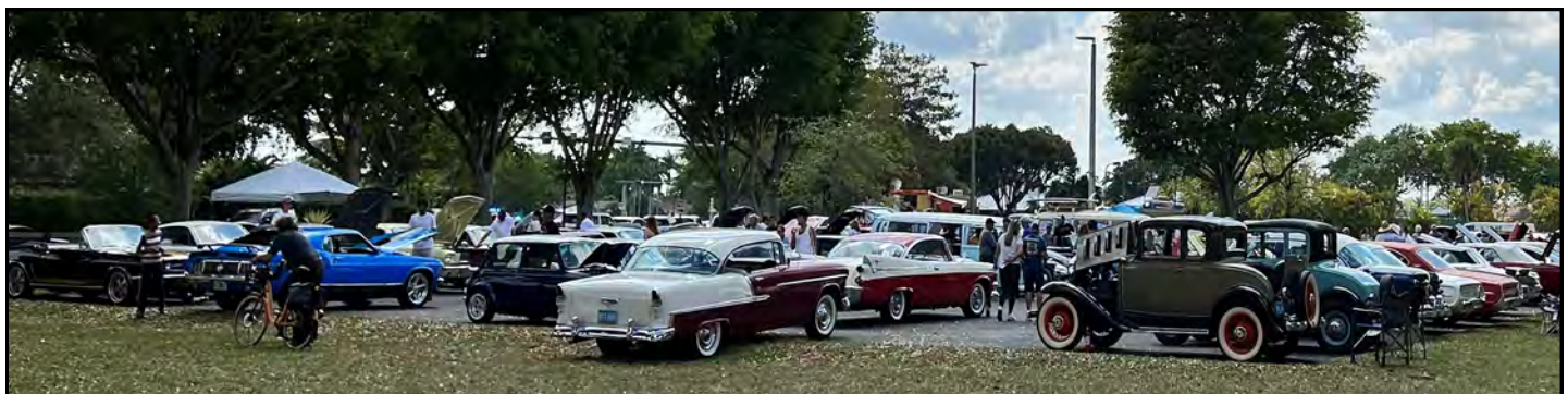
Below: A view from outside the park